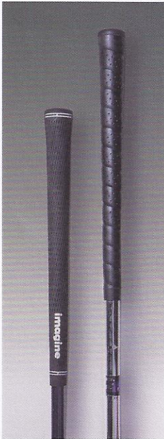
Compared to a typical 3-iron replacement club, the Middleclub 3 has a considerably shorter shaft giving the golfer more accuracy and control.

After rigorous testing, players of all handicaps report that the patent pending Middleclub is much easier to hit and control, and their shots go as far or farther than long-irons.